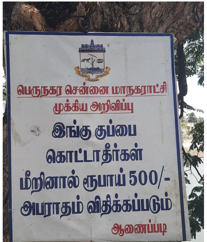
Noticeboard installed to prevent littering

She was amazed to find out how with the simple act of drawing attention to the problem, she found both - a cure and a preventive measure for a problem! This was no less than a dream come true for her.